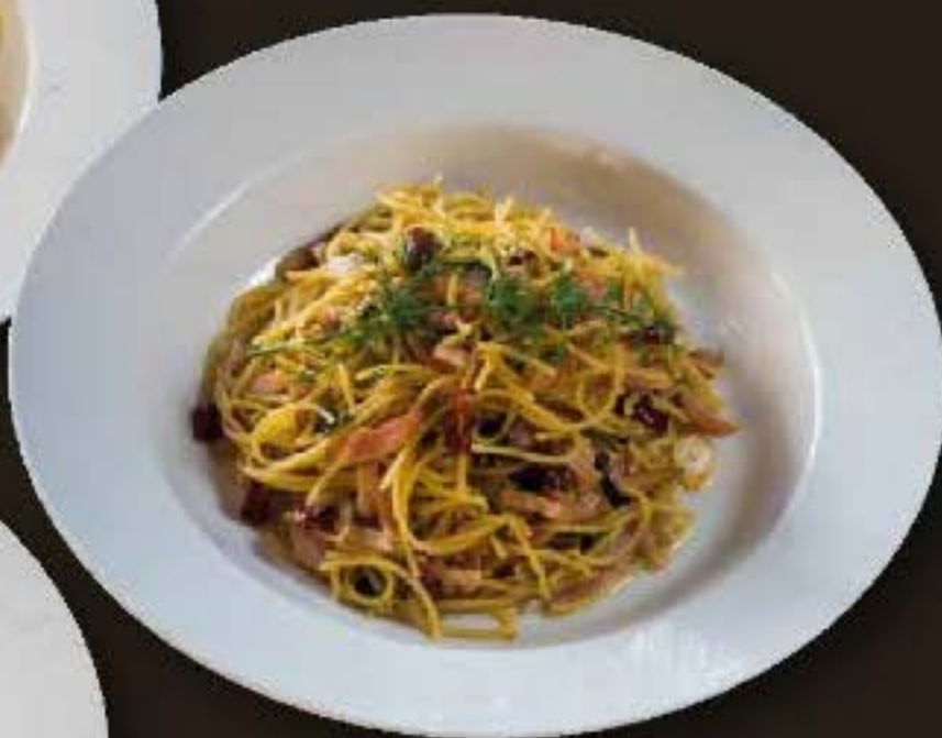
8. FETTUCCHINE OR SPAGHETTI SPICY BACON 15.90 Bacon, mushroom, garlic, dried chilli, herb white cream sauce