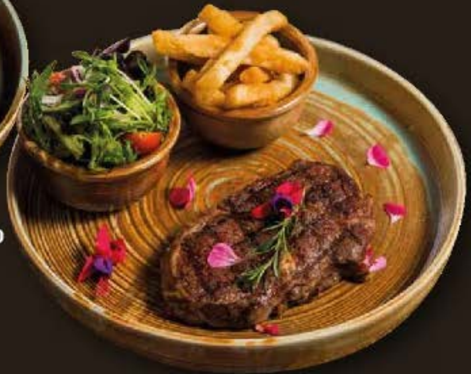
2. SCOTCH FILLET (250 Gram) 29.90 with 2 choices of mashed potato or salad or chips and a choice of mushroom, pepper or gravy sauce