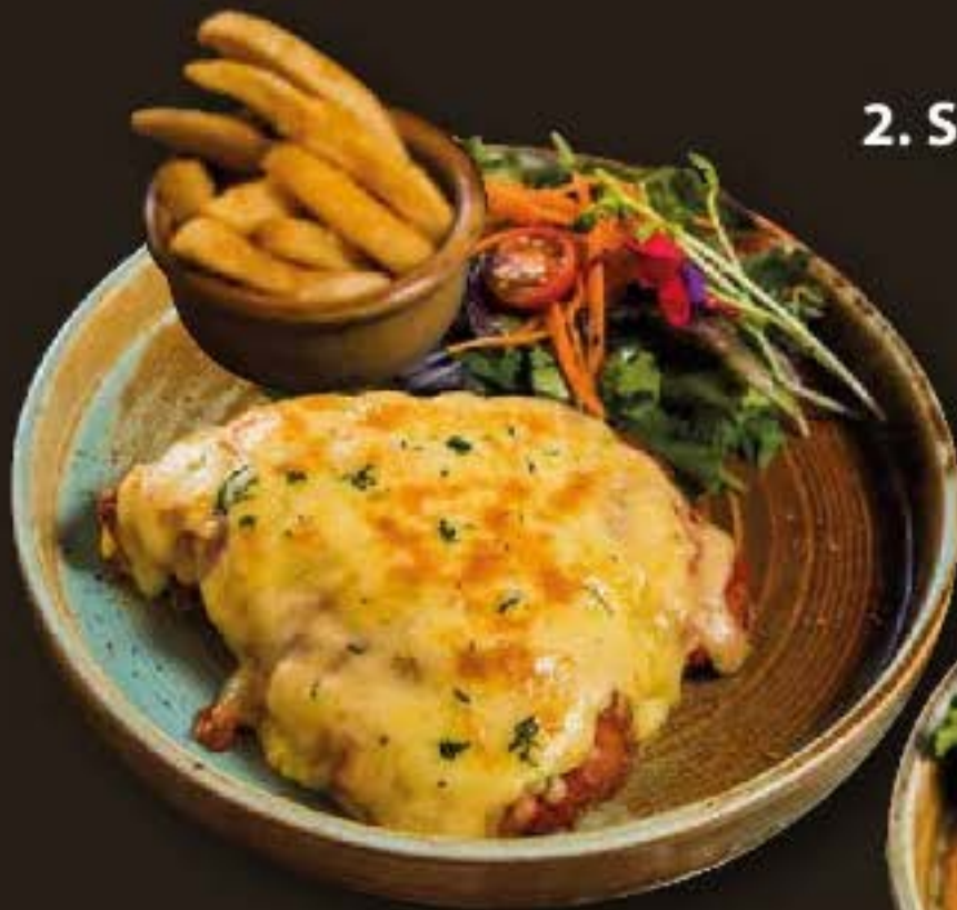
3. CHICKEN PARMIGIANA (250 Gram) 19.90 Crumbed chicken breast topped with ham, Napoli sauce and melted cheese with 2 choices of mashed potato or salad or chips