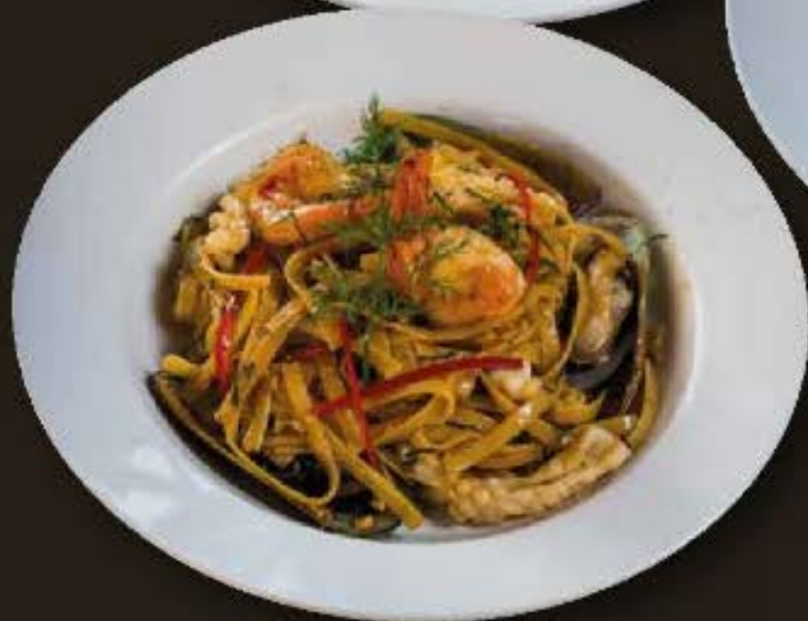
9. FETTUCCHINE OR SPAGHETTI KEA MOW SEAFOOD 19.90 Prawn, mussels, squids, and fish fillet in Napoli sauce topped with mozzarella cheese