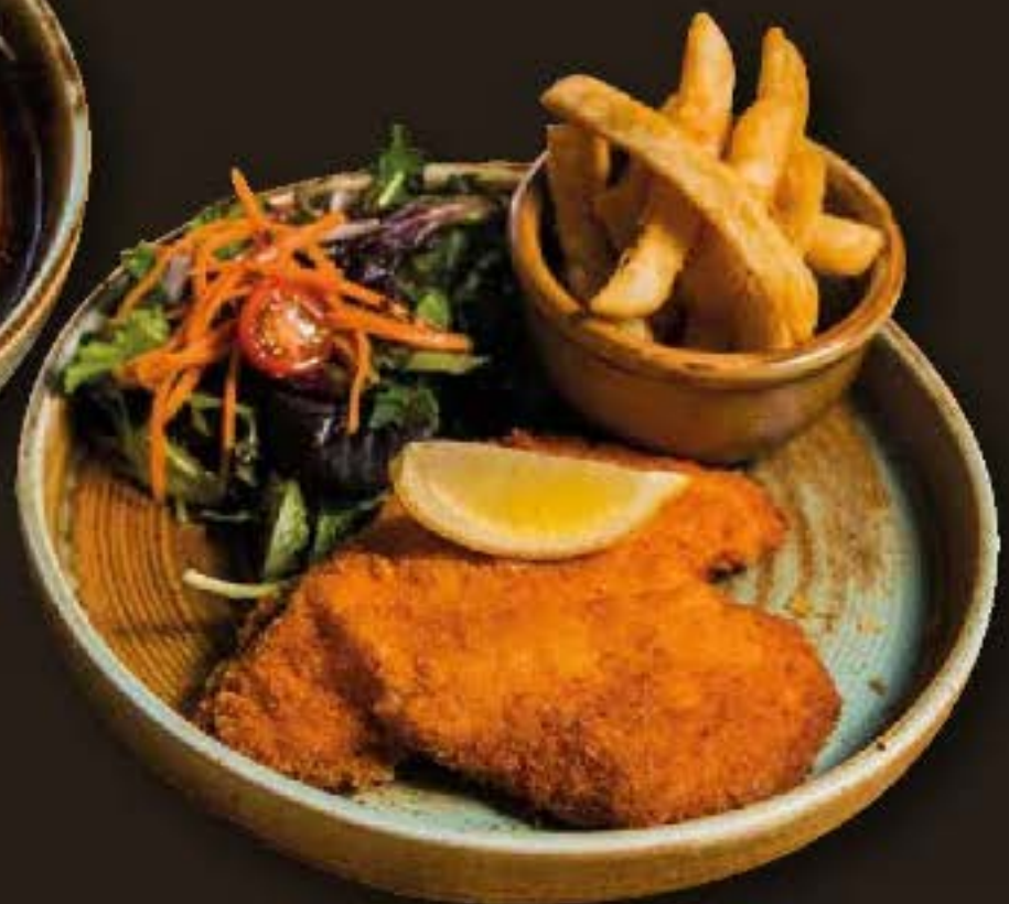
4. CHICKEN SCHNITZEL (250 Gram) 16.90 Crumbed chicken breast served with 2 choices of mashed potato or salad or chips