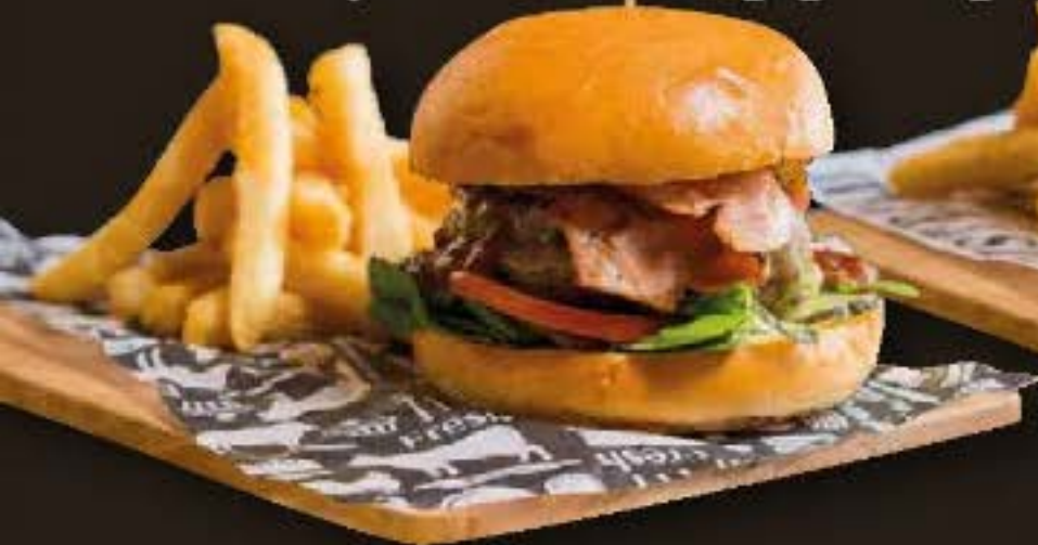
5. BEEF & BACON BURGER 15.90 With tomato relish, mustard, pickle and salad served with beer battered chips