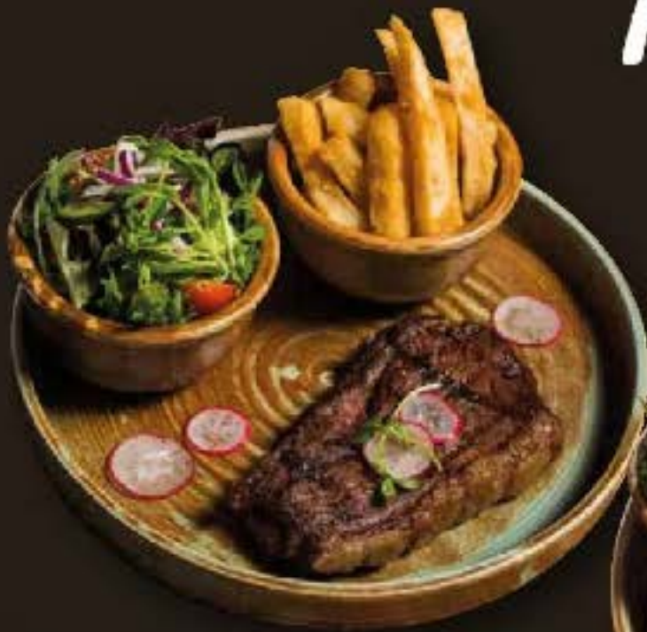
1. RUMP STEAK (250 Gram) 16.90 with 2 choices of mashed potato or salad or chips and a choice of mushroom, pepper or gravy sauce