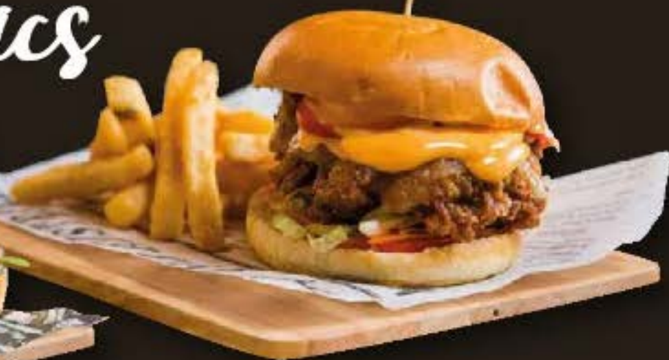
6. FRIED CHICKEN BURGER 14.90 Served with ice burg slaw, tomato, Sriracha mayo and beer battered chips