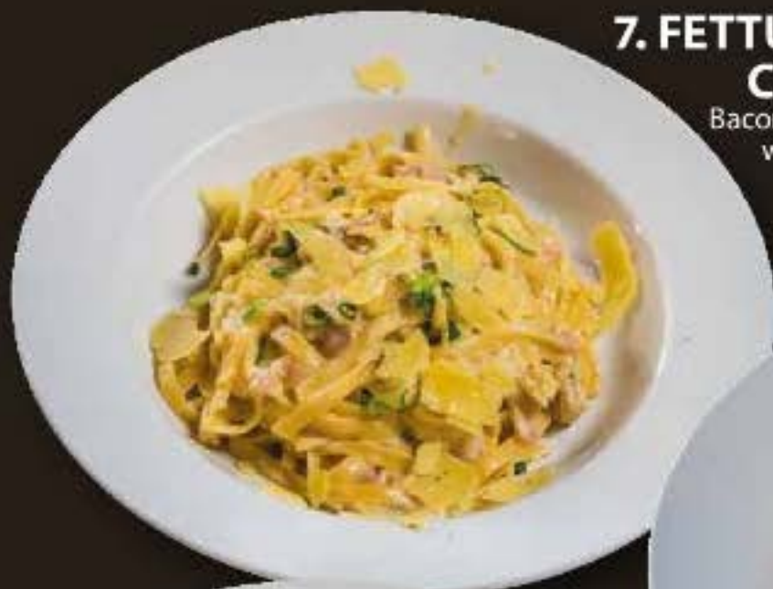
7. FETTUCCHINE OR SPAGHETTI CARBONARA 15.90 Bacon, mushroom and red onion in white cream sauce topped with mozzarella cheese