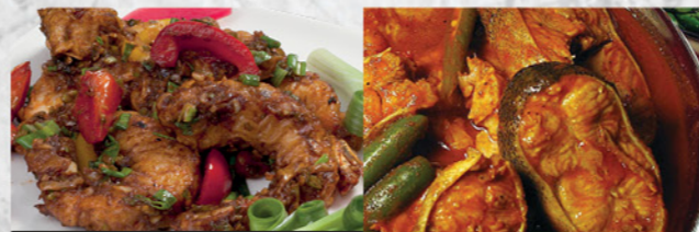
Sizzled Chilli Shrimps