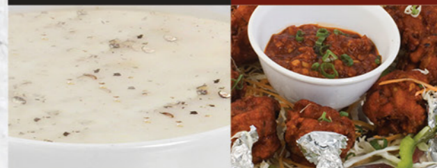
Cream of Chicken Soup