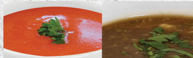
Cream of Tomato