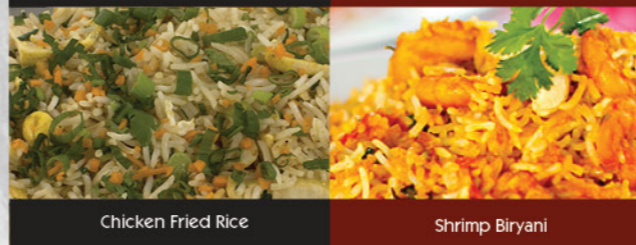
Chicken Fried Rice