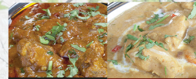
Mutton Rogan Josh