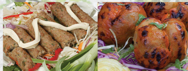
Mutton Seekh Kabab