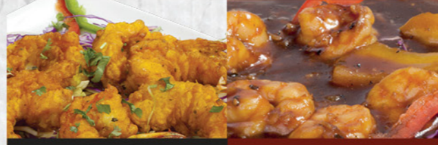
Shrimps Koli Wada