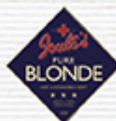
Joule's Pure Blonde

Light, refreshing & subtle, a perfectly balanced blonde ale.