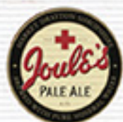
Joule's Pale Ale

We have paired some of our dishes with the Joule's Ale that best compliment the flavours & below are tasting notes to help you decide for the other dishes.