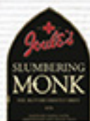
Joule's Slumbering Monk

Rich, copper ale with a real depth of flavour, created using a careful blend of English ingredients.